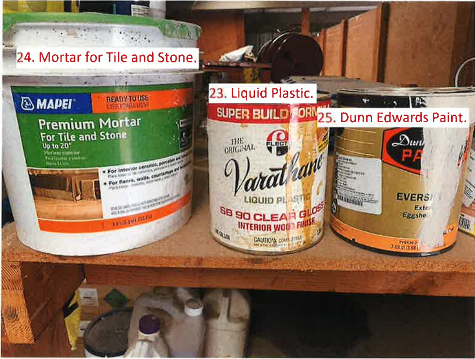
24. Mortar for Tile and Stone.