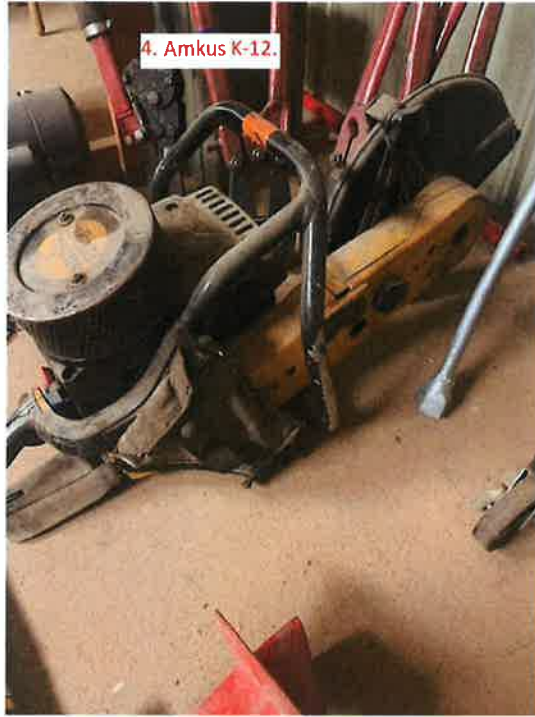
4. Amkus K-12.