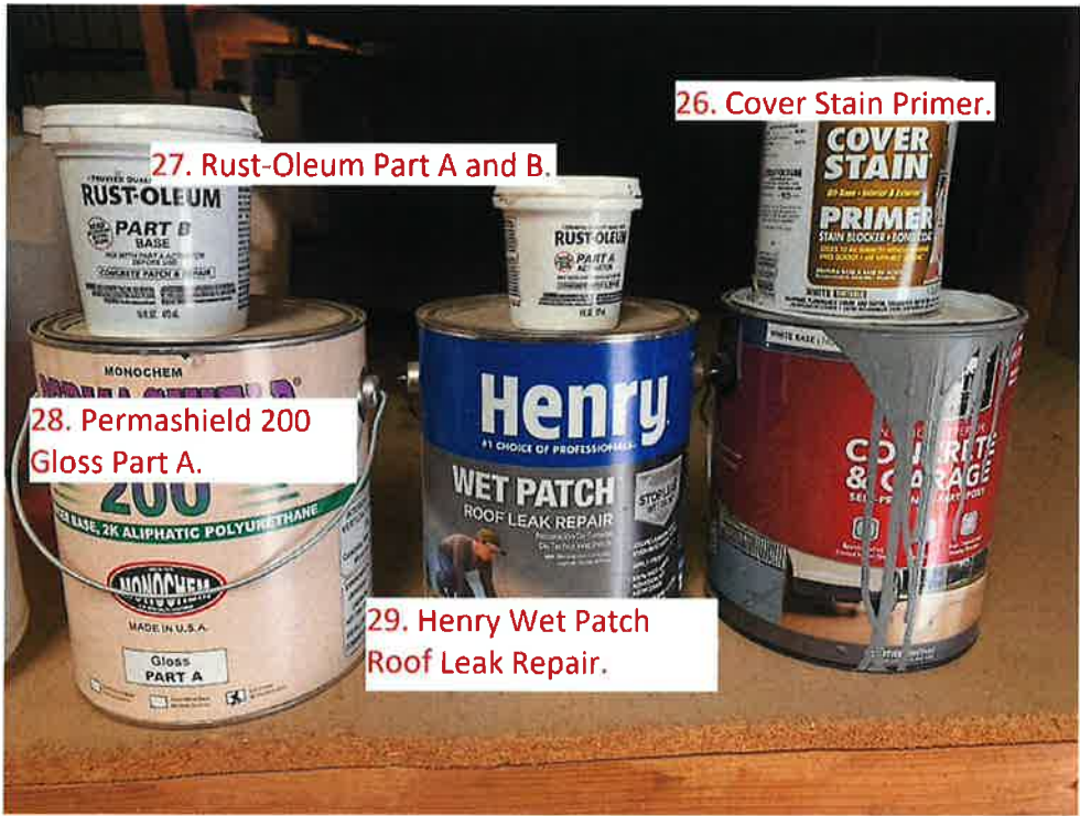
27. Rust-Oleum Part A and B.