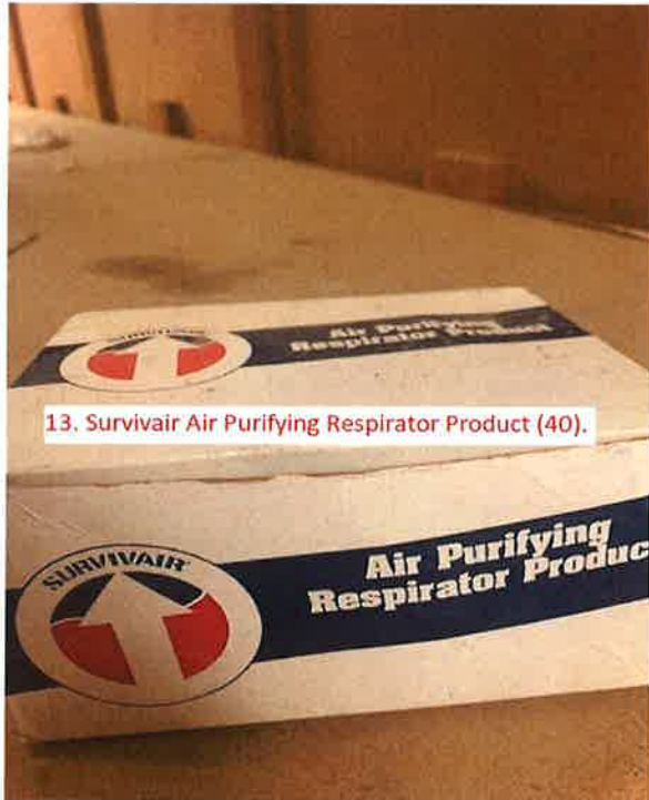
13. Survivair Air Purifying Respirator Product (40).