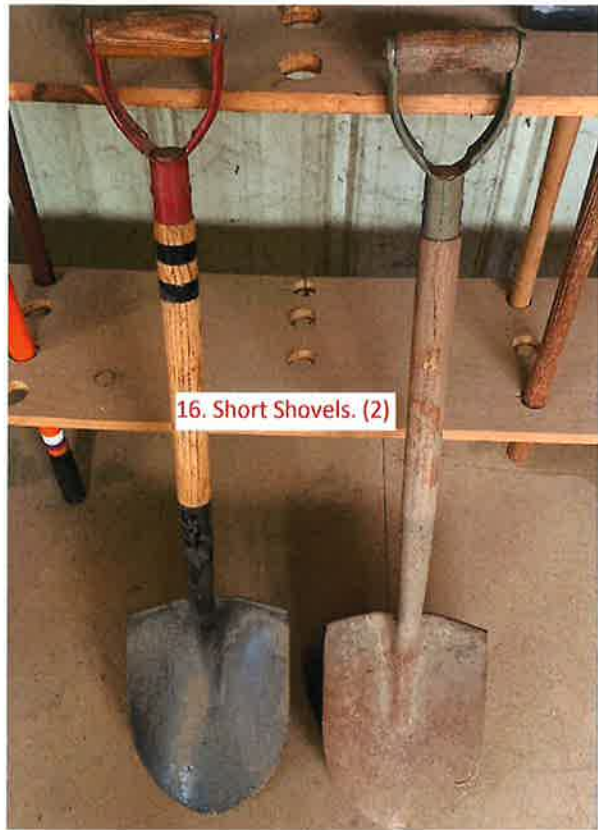
16. Short Shovels. (2)