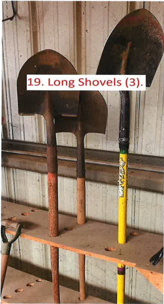
19. Long Shovels (3).