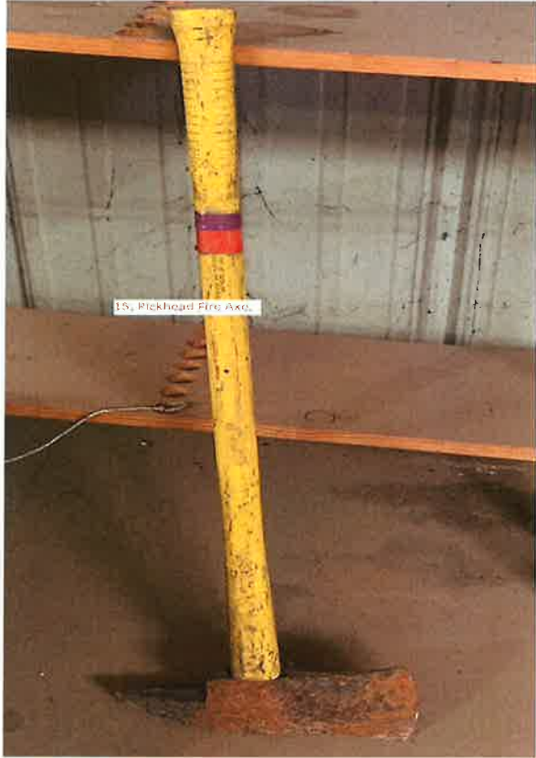
15. Pickhead Fire Axe.