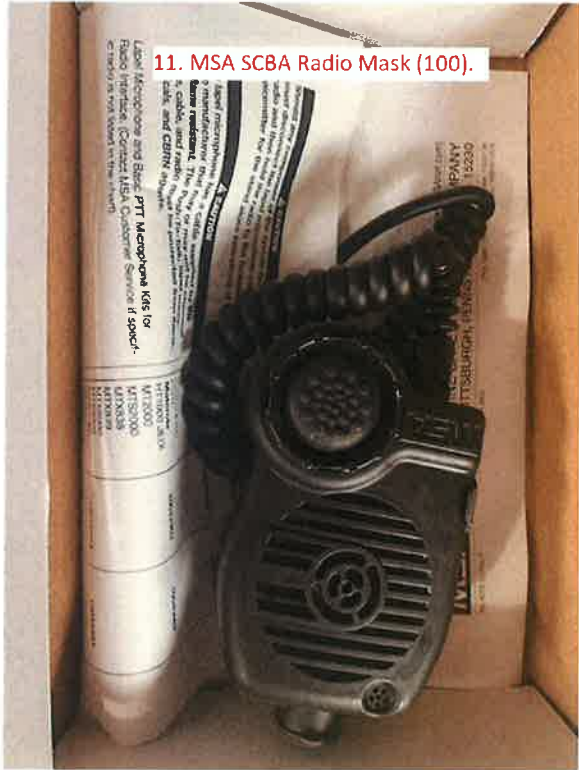
11. MSA SCBA Radio Mask (100).