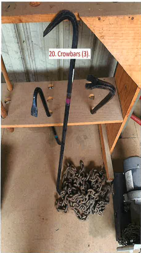
20. Crowbars (3).