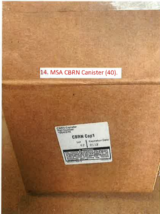
14. MSA CBRN Canister (40).