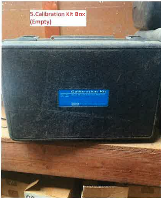
5. Calibration Kit Box (Empty)