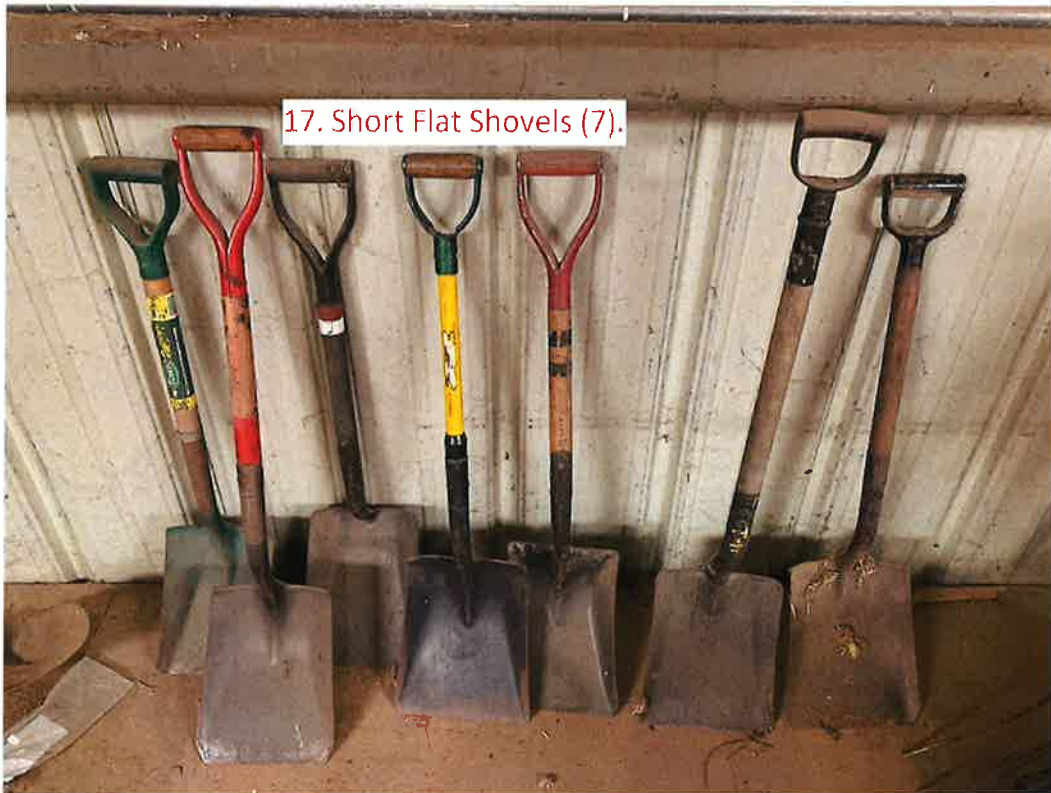
17. Short Flat Shovels (7).