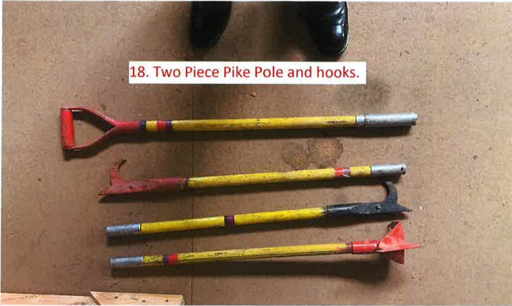
18. Two Piece Pike Pole and hooks.