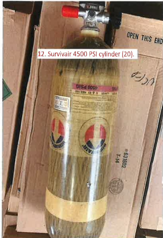
12. Survivair 4500 PSI cylinder (20).