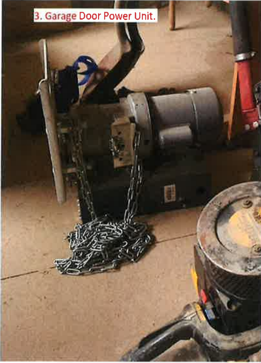
3. Garage Door Power Unit.